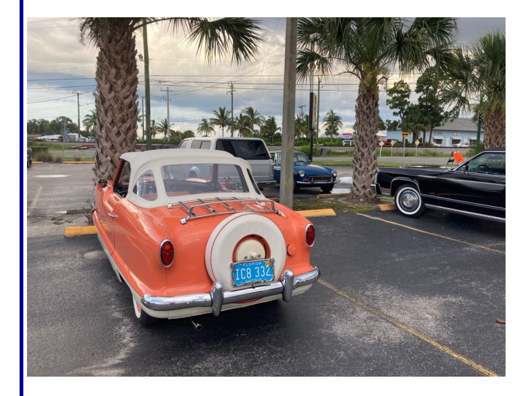
If you want to see more pictures from the cruise, click <u>HERE</u>.