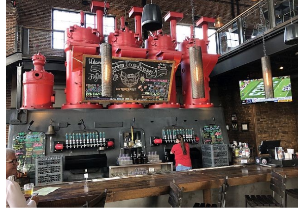
The centerpiece of the restaurant is a MAM- MOTH 750-kilowatt Busch-Sulzer air injected diesel generator.

In addition to their local brews, the American Icon Brewery also features a delicious food menu as well. <u>CLICK HERE</u> for a peek. We'll have our meeting and lunch upstairs overlooking both the giant engine and the brewing room. AIB is also setting aside part of their parking lot for our classic cars to use.