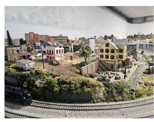
The train layouts were so realistic and meticulously designed.

Pretty sure they were having a car show at this little village.