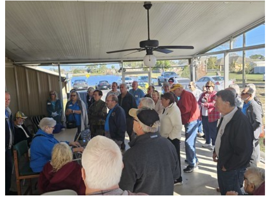
To see all the pictures from the January meeting, click HERE .