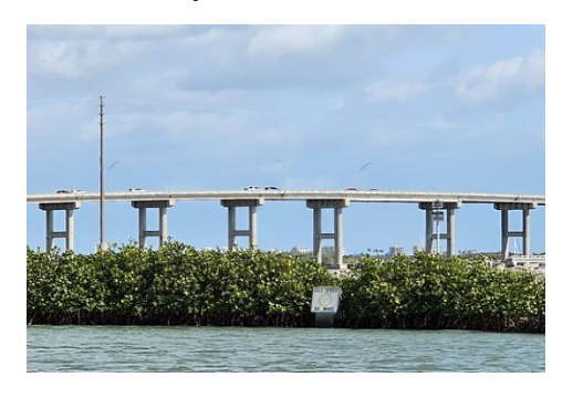
To see all the pictures from the January meeting, click HERE .

As we peacefully cruised down the Indian River Lagoon, we saw dolphins (flipper, not Mahi), manatees, and other river creatures. At one point if you squinted hard, and twisted your neck, you might have saw an eagle nest that has been inhabited for the last 30 years.