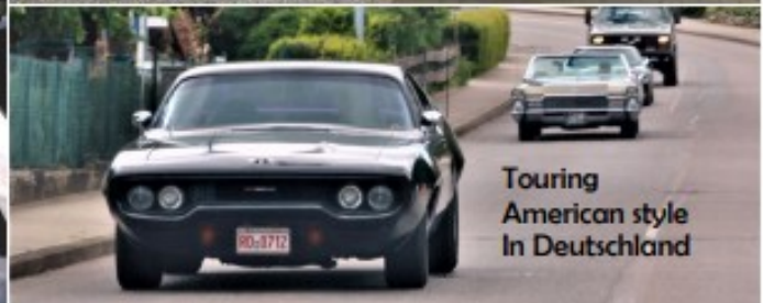
Touring American style In Deutschland