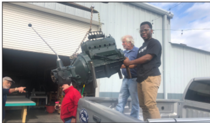
Preparing to return the rebuilt engine.

AFTER THE CAR was completely taken apart, we moved the frame inside to a stall inside the Project Lift garage for cleaning, preparation, and priming. Students had fun painting and mounting new tubes and tires.