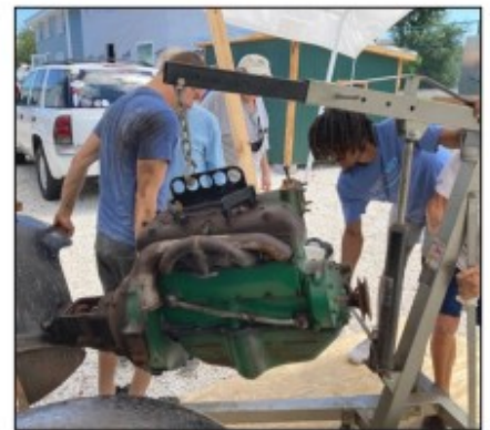
Once removed, the engine was checked by a machine shop.

ON MARCH 2, 2022 , three members of the club went to Miami, picked up the A, and delivered it to Project Lift.