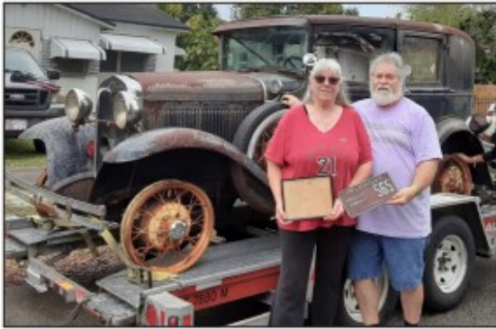
Transporting the donated car.

YOUTH PARTICIPATION , community service, and preserving a piece of history became the mission of the Palm Beach A's in January 2022. It started when a former club president received an email from a couple in Miami who had a 1930 Fordor to donate. It had sat outside in the Florida weather for years and was "rough."