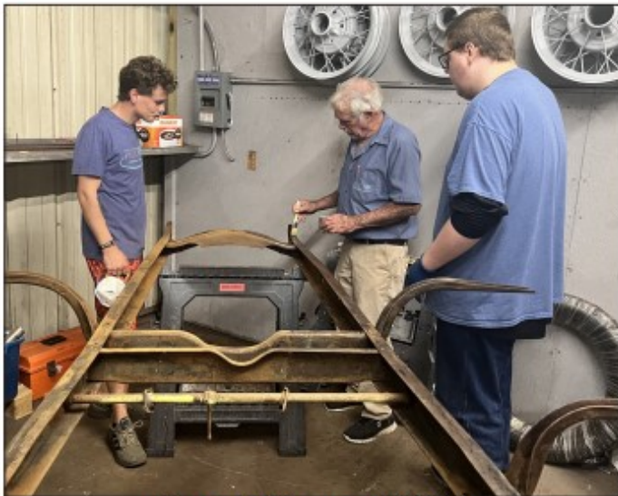
Demonstrating use of OSPHO.