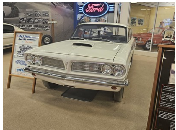
1963 Pontiac Tempest

To see all the pictures from the meeting, click HERE .