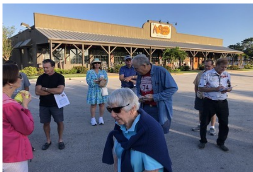
From start to finish of the 2024 Cracker Tour

If you're really interested in getting "on the road again" with a few of your (sometimes) rowdy friends and seeing some sites along the way, TCVCC has you covered with our extended 4 day tours driving your antique car or truck. Participant's vehicles must be at least 25 years old. Of course, we stay off the Interstates and Turnpikes and pretty much follow Florida's more leisurely state highways and back roads, where old Florida can still be found. The April "Cracker Tour" is a recent example. Photos of which can be viewed via the links found on our website's Club Activities Page . Take a look and you'll see participants had fun!