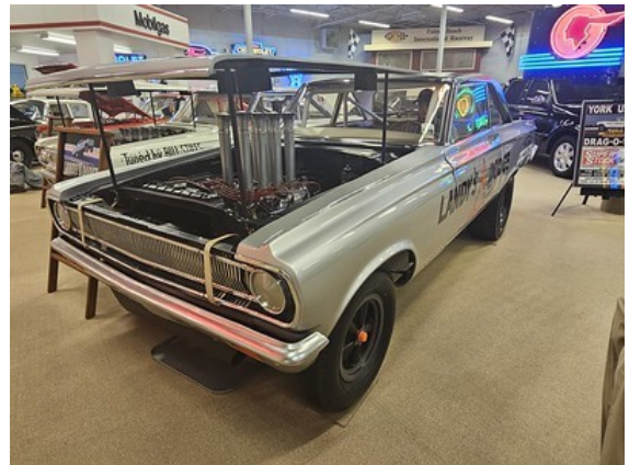
1965 Dodge Coronet