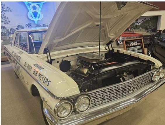
1962 Ford Galaxie

Eventually, Nick started collecting old drag cars, especially ones from his old days of racing. What started out small has grown to a fantastic collection of some of the finest factory drag cars out there. Here are just a few of the cars housed at Factory Lightweights.