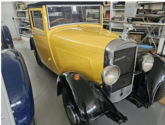
Amilcar in production from 1927-1935